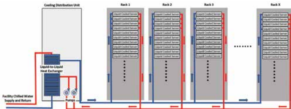
Integrated Rack Cooling Distribution Units (CDUs)